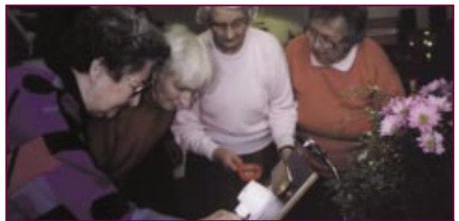
Activity at the Forest of Dean